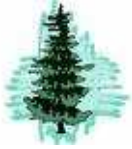
Photo Available on SDHSA Secure Site Only

With a temperature of 60 degrees the weather was pretty much perfect (or much better than it could have been in mid-November). Before and after the tour, the kids had fun playing on their piles of dirt and gravel. In between, the plantation owner used his truck to pull us, in a wagon, through the plantation. He frequently stopped to tell us the names of the types of trees we were seeing, giving us facts about many of them, such as types of weather, elevations, etc. that are desirable or essential to growing them. After the wagon ride, we were able to visit a couple of his staff members who were making wreaths.